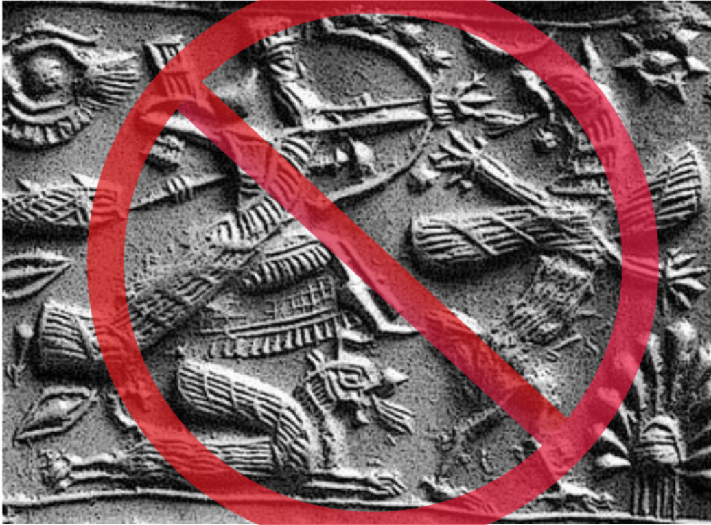
Marduk and Tiamat